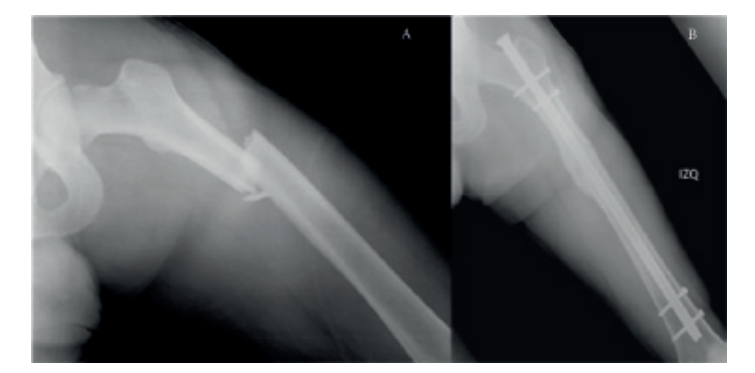
Figures 3A and 3B. shows the x-rays of one of the participants in the device-group at baseline time and 24 weeks after.

Diaphyseal femur fractures have a union rate between 90-100%, depending on the series<sup>3,17</sup>; nevertheless, in the clinical practice, non-union continues occurring frequently. Currently, it can be higher than 10%, given the introduction of damage control