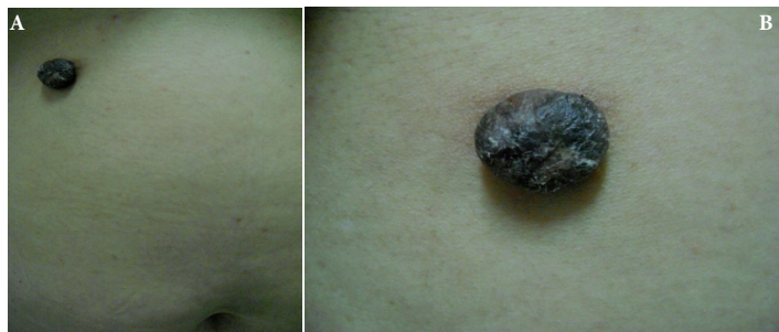
Figure 1: A and B. Hyperpigmented, hyperkeratotic nodule on abdominal skin. Lesion appear to be 0.5 mm long x 0.3 mm wide in size

report was a dermal tumor mass from the lower portion of the epidermis, well defined, formed by small cuboidal cells without atypia, arranged in well-defined bands that anastomose without barricade, with pigmented areas and few dilated ducts, which are in contact with the resection margins, compatible with eccrine poroma (Fig. 2). Immunohistochemistry was also performed, highlighting Carcinoembryonic Antigen (CEA) with elongated cells that line the cavities that support glandular differentiation. S100 staining was observed in the dendritic cells and melanocytes in the thickness of the cell proliferation (Fig. 2).