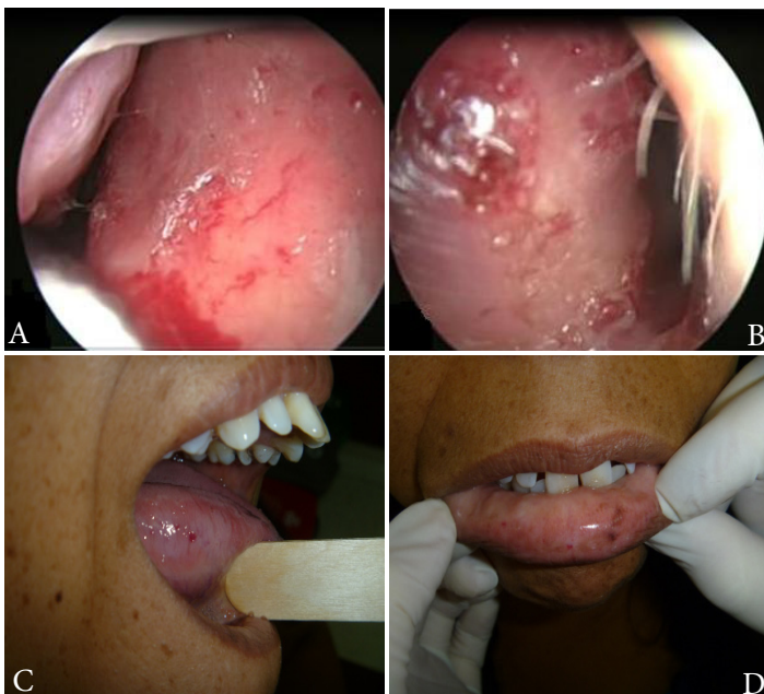
Figure 1. Rhinoscopy with zero-degree endoscopy lens showing telangiectasias on septal mucosa of the right side (A) and left side (B). Telangiectasia on the tongue (C) and lower lip (D).