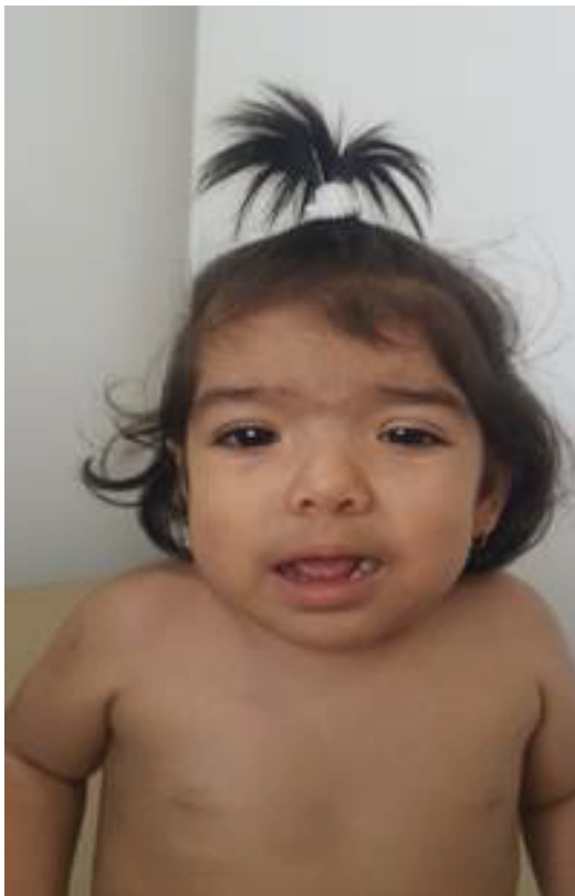
Figure 1. Facial appearance of one-year-old girl with Wiedemann-Steiner Syndrome. frontal hypertrichosis, low anterior hairline, thick eyebrows, synophrys, long eyelashes, hypertelorism, left palpebral ptosis, epicanthic folds, downslanted palpebral fissures, low set ears, and wide and depressed nasal bridge.

The paraclinical tests performed on the patient included Normal brain MRI performed at 10 months of age. A renal