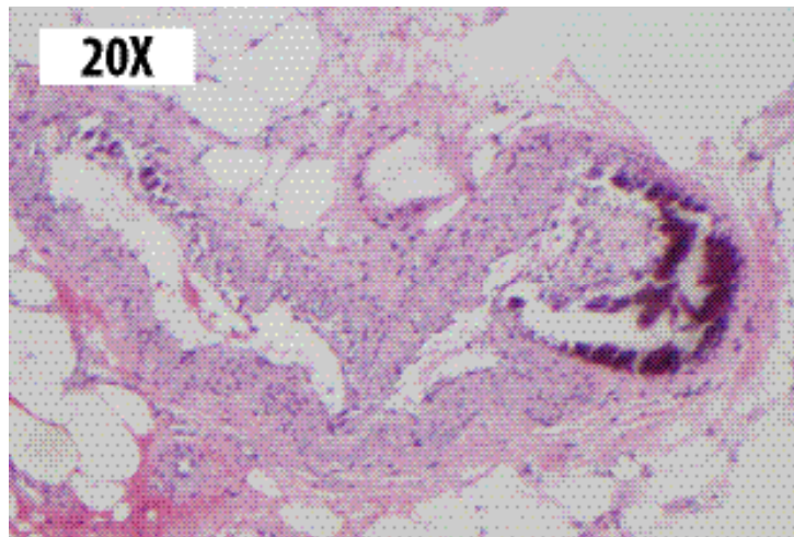
Figure 2 Skin biopsy: hematoxylin-eosin stain 20x. Dystrophic calcification in medium size arteries with intimal proliferation is observed at the hypodermis level.

Three weeks later, because of the marked decrease in the serum calcium and phosphorous concentrations, we occasionally added a treatment with paricalcitol 1.0 mcg after hemodialysis, thus controlling the elevated levels of parathyroid hormone (iPTH).