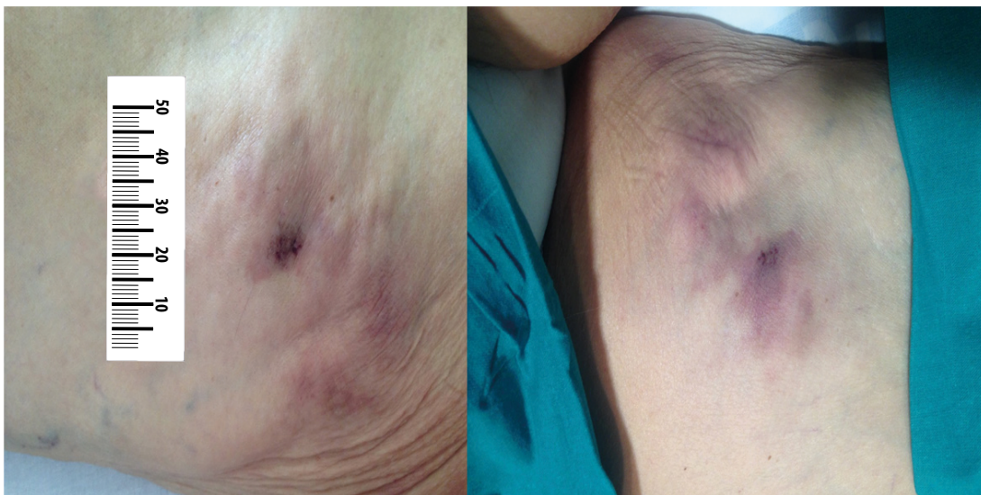
Figure 1. Subcutaneous, non-ulcerated and violaceous nodules on her left front and back thigh respectively, prior to the treatment.

Due to poor digestive tolerance, cinacalcet was replaced by etelcalcetide at an ascending dose of 5 mg intravenously injection after each hemodialysis session due to its lower incidence of gastrointestinal effects.