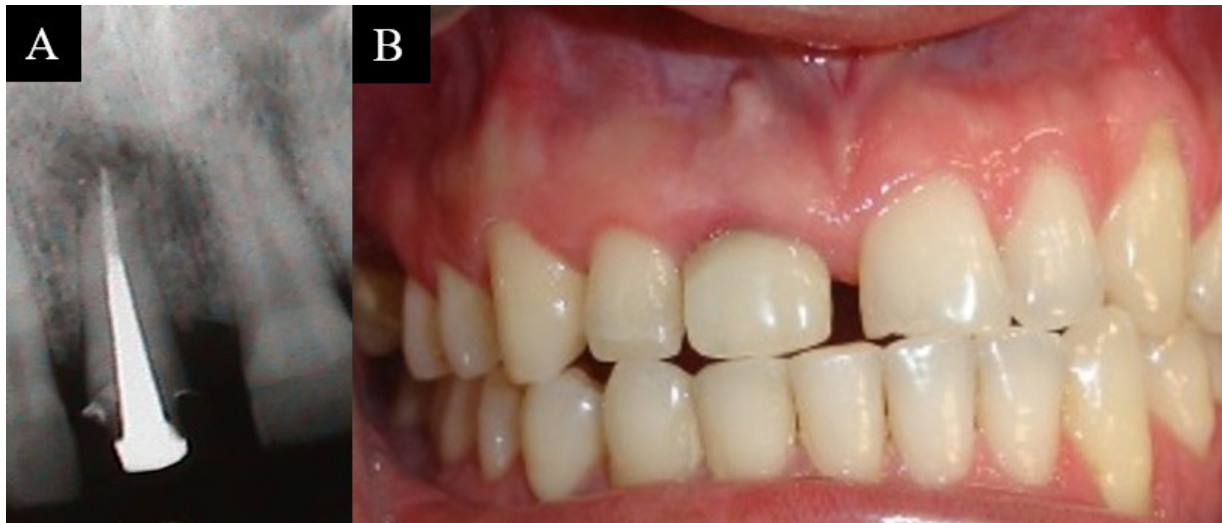
Figure 1. A. Intraradicular post and apical lesion. B. Asymmetry of the gingival zenith on tooth 11.