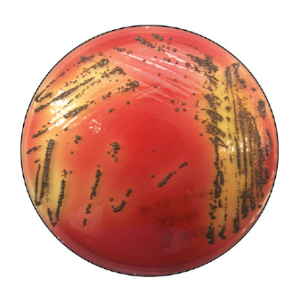
Figure 1. Colony of P. gingivalis , W83 strain, cultivated in blood agar. These are observed in black due to their capacity to attract iron from the culture medium.

there are signs of marked destruction of supporting tissue.