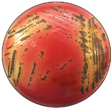
Figure 1. Colony of P. gingivalis , W83 strain, cultivated in blood agar. These are observed in black due to their capacity to attract iron from the culture medium.

there are signs of marked destruction of supporting tissue.