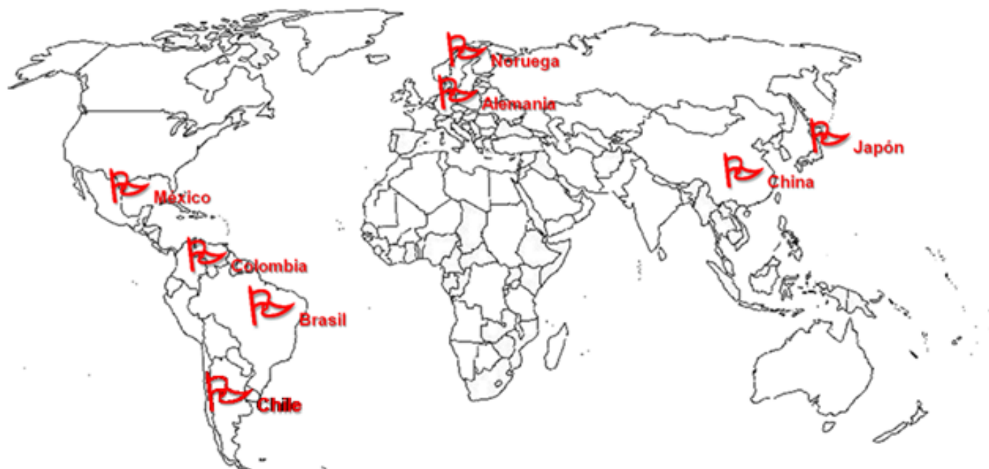
Figure 2. Geographic distribution of world populations where studies have been done on Genotipification of the fimA gene of Porphyromonas gingivalis .

Additionally, they analyzed samples of 44 adult patients with trisomy 21 (men and women aged between 20 and 35 years) and 39 adults with mental retardation (men and women aged between 20 and 35 years). With the samples of these last patients genotyping was done with the six genotypes described and it was found that in patients with periodontitis the type II (47.4%), type Ib (13.5%), and type IV (12.5%) genotypes are relatively more prevalent compared to healthy patients, who presented frequencies of 50.4% in type I and 12.2% in type V. Likewise, this study reported that the odds ratio (OR) for the adult population in Japan (indicating the relationship between periodontitis and fimA ) was higher for fimA II (OR 77.80 with 95% confidence interval of 31.0–195.4).